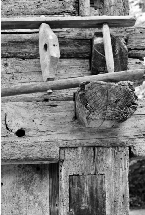
Ballenberg, swiss open-air museum, Switzerland. (Jan Kubec)